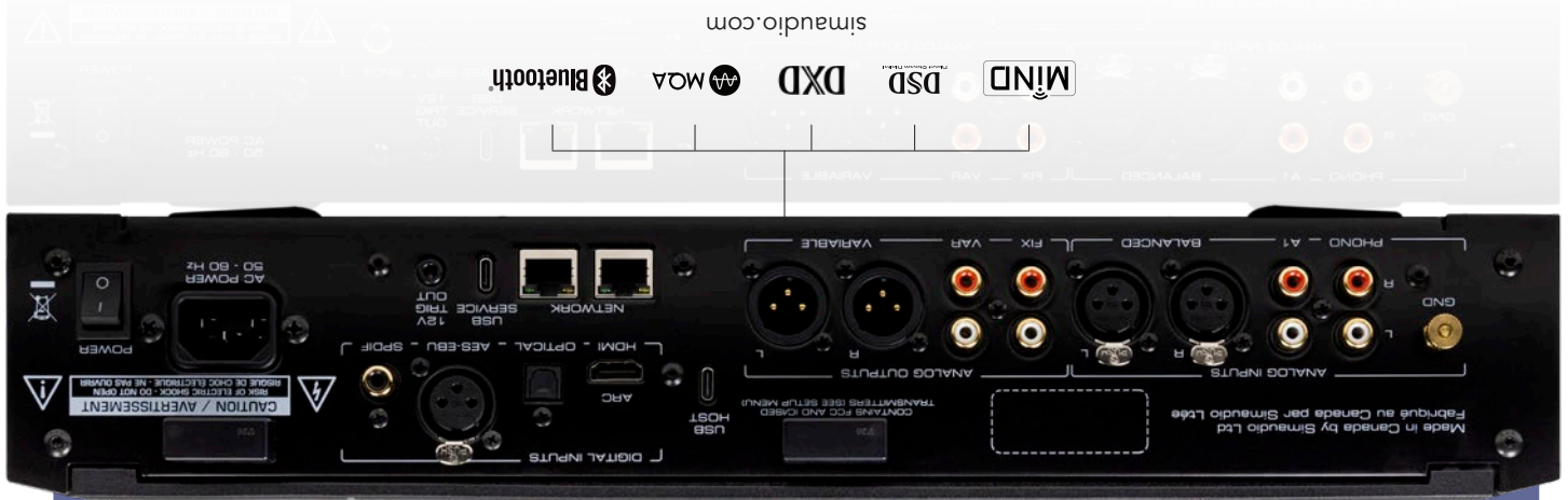
491 Network Player/Preamplifier