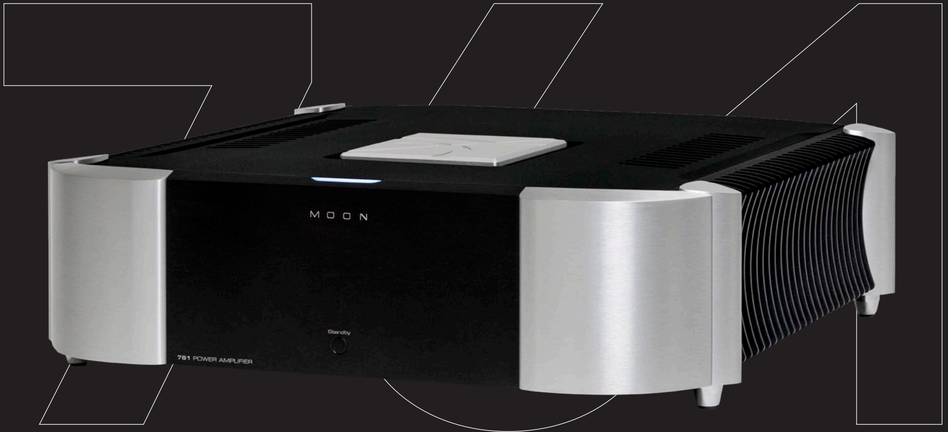
— 761 Power Amplifier —