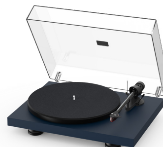
Satin Steel Blue