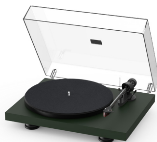
Satin Fir Green