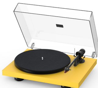
Satin Golden Yellow