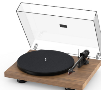
Satin Real-Wood Walnut Veneer