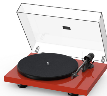
High Gloss Red