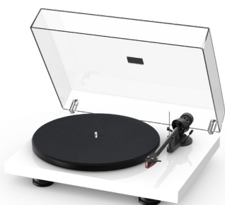
High Gloss White