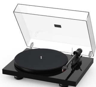
High Gloss Black